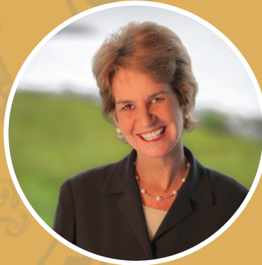
KATHLEEN KENNEDY TOWNSEND